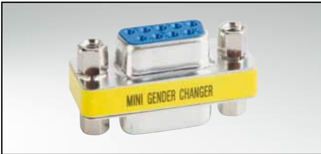
RoHS compliant – CSA listed, File No.: LR 115000-1 – UL listed, File No.: E202784