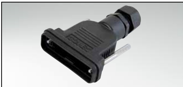
RoHS compliant – CSA listed, File No.: LR 115000-1 – UL listed, File No.: E202784