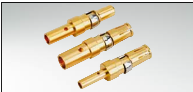
RoHS compliant – CSA listed, File No.: LR 115000-1-UL listed, File No.: E 228329